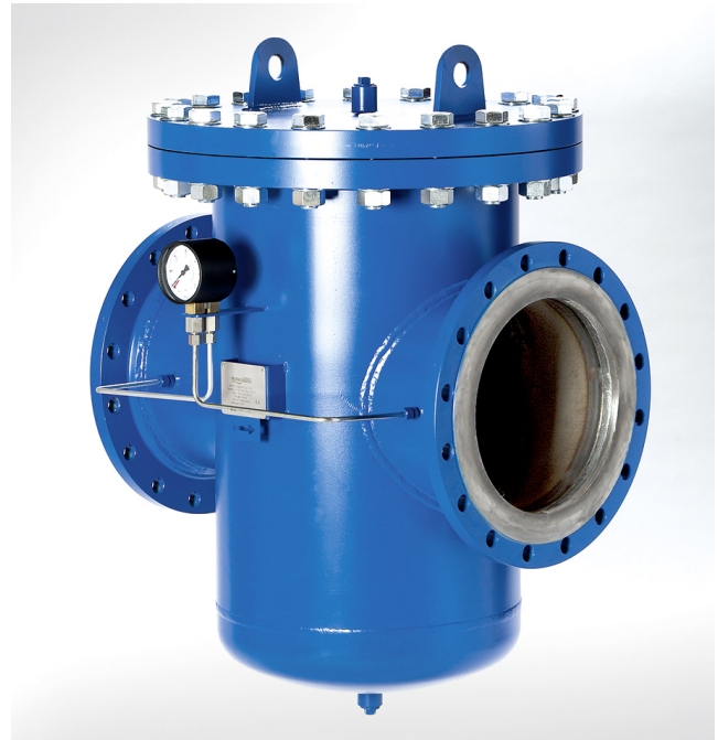
The figure shows optional accessories

Operating instructions, know how and safety instructions must be observed. The pressure has always been indicated as overpressure. We reserve the right to alter technical specifications without notice.